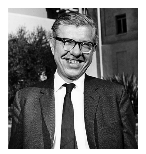
Fig. 1. Fred Hoyle on the Caltech campus in February 1967. The now destroyed dome of historic Throop Hall rises poetically behind him. Hoyle has just invited the author to participate in the five-year authorization of his Cambridge Institute of Theoretical Astronomy. At the time of this photograph we were discussing the newly discovered (Bodansky et al., 1968) quasiequilibrium that governs silicon burning, a quasiequilibrium that Hoyle had dimly perceived in his picture (Hoyle, 1954) of primary nucleosynthesis.

In 1971 it was immediately evident from Fig. 1 that the solar abundances had been spectacularly reproduced. The O-burning shell (a) had been responsible for the isotopes <sup>28</sup>Si and <sup>32,33,34</sup>S, <sup>35,37</sup>Cl, <sup>36,38</sup>Ar <sup>40,42</sup>Ca and <sup>50</sup>Ti; the shell of incompletely burning Si (b) had been responsible in the summation for about half of the alpha-isotopes isotopes <sup>28</sup>Si, <sup>32</sup>S, <sup>36</sup>Ar and <sup>40</sup>Ca and for isotopes <sup>48,49</sup>Ti, <sup>51</sup>V, <sup>50,52,53</sup>Cr, <sup>54</sup>Fe and about one-third of the <sup>56</sup>Fe. The alpha-rich freezeout had been responsible in the summation for